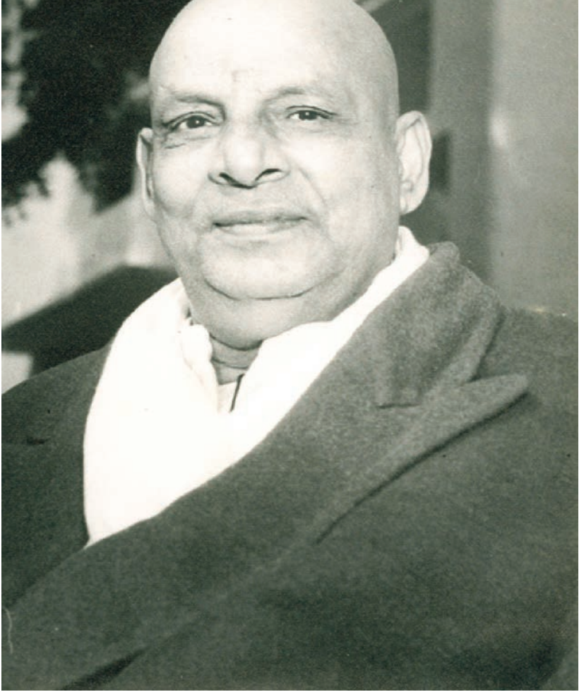
Swami Sivananda Saraswati