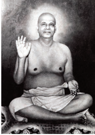
Swami Sivananda Saraswati